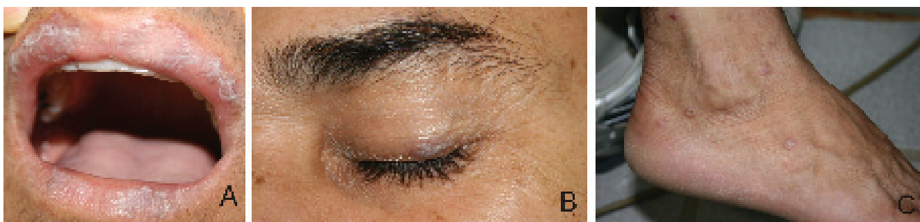
Fig. 3. Lesions in lip (A), upper eyelids (B) and inferior member (C).

The microscopic findings were the same as those for the previous case, and in focal areas, the presence of basophilic degeneration from collagenous fibers was observed. The patient was treated topically with 0.05% clobetasol propionate for fifteen days for regression of the lesions. The evaluation of skin lesions was conducted by a dermatologist.