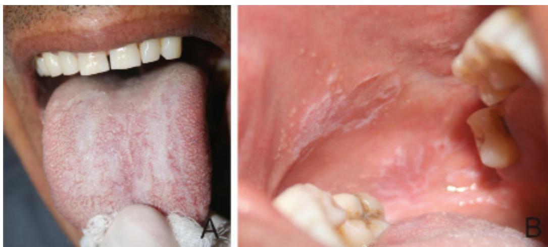
Fig. 1. Lesion in the dorsum of the tongue with papular form (A) and in the right buccal mucosa with white striations (B).

At clinical examination, the lesion was localized on the dorsum of the tongue and was of the papular form (Fig. 1A), and other lesions were identified in the left and right buccal mucosa (Fig. 1B) that showed up as white striations; no ulcer was present. The clinical diagnosis was oral lichen planus. For confirmation of this diagnosis, an incisional biopsy of this lesion was requested. An anti-HCV test was also requested, and the result was negative.